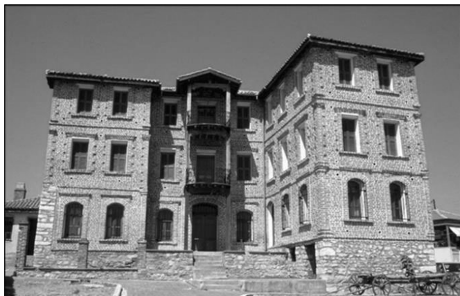
Fig. 2. The Brikas Municipal Historical Museum.