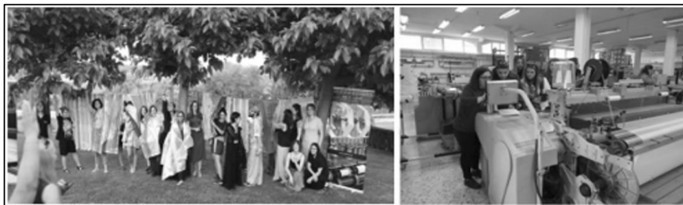
Fig.4. Art students in Soufli, 2022.

Numerous university projects are implemented in a regular basis. The Konstfact, Applied Arts Academy of Stockholm, the Fine Arts Academy of Athens and the New Bulgarian University have a permanent cooperation with the Stakeholders in Soufli. Besides the visits, it is the works they create and the exhibitions, taking place in Athens, Stockholm, Sofia and elsewhere, which promote silk and Soufli. (Fig. 4) Various universities, such as the Aristoteleion University, Thessaloniki, in a Niarchos Foundation project, the Architecture Academy of the same University, the Kapodistrian University of Athens are in a repeated cooperation with Soufli. Some months ago post-graduate designers, from all over the world, sent through the Economic University of Sustainable Development and Cyclic Economy worked in the town.