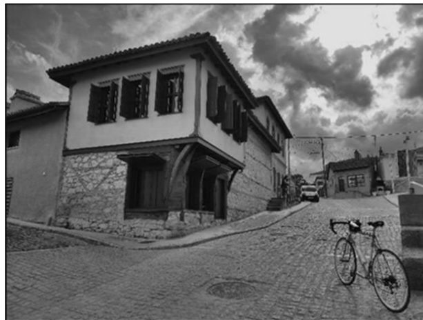
Fig.1. The Silk Museum of the Piraeus Bank- Group Cultural Foundation.

The Silk Museum of the Piraeus Bank Group Cultural Foundation is sheltered in a 19th century “cocoon-manor” complex, donated by the famous writer and “doctor-philosopher” Konstantinos Kourtidis’ family. The permanent exhibition traces the diachronic history of silk, focusing on the route of Soufli towards its raise to a major silk-production center from the late 19th century on, while it incessantly hosts a series of events, such as theatrical plays, ateliers, or exhibitions (Fig.1).